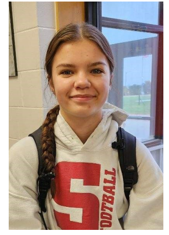
I can set a good example for others.