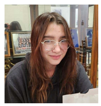
I get to do things my mom never got to do.