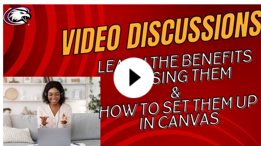
Chadron State College educators learn the benefits of using weekly video discussions for online courses and how to set the process up in the Canvas course.