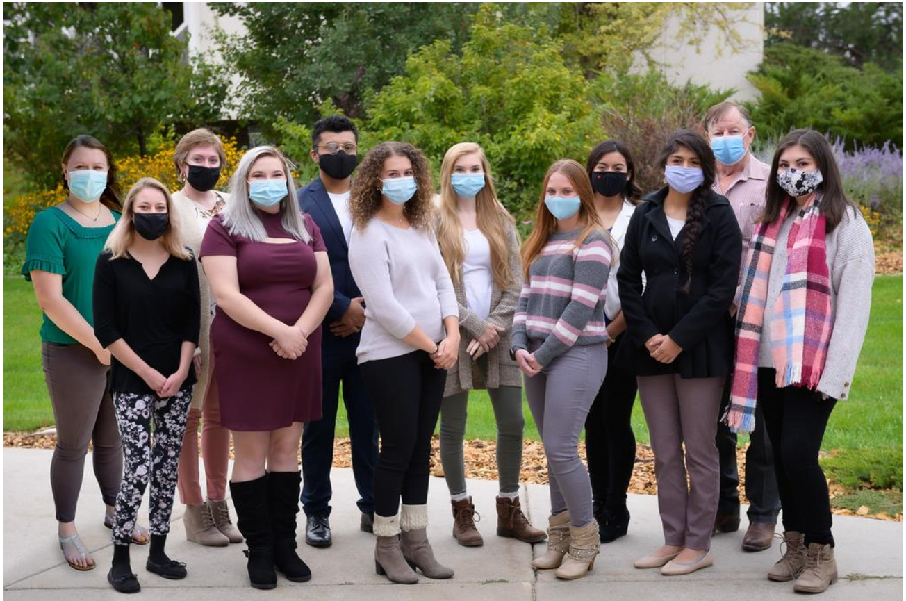
Chadron State Crowdfunding - Social Work Conference

We are Chadron State College. We are Eagles. Together we can soar higher. The Chadron State Crowdfunding platform will provide an opportunity for you to help the next generation take flight. You can join other students, faculty, staff, and alumni in supporting projects and activities by making gifts through the CS Crowdfunding platform. And because the platform is managed by the Foundation, all campaigns are screened and verified, guaranteeing your contributions will support their intended purpose.