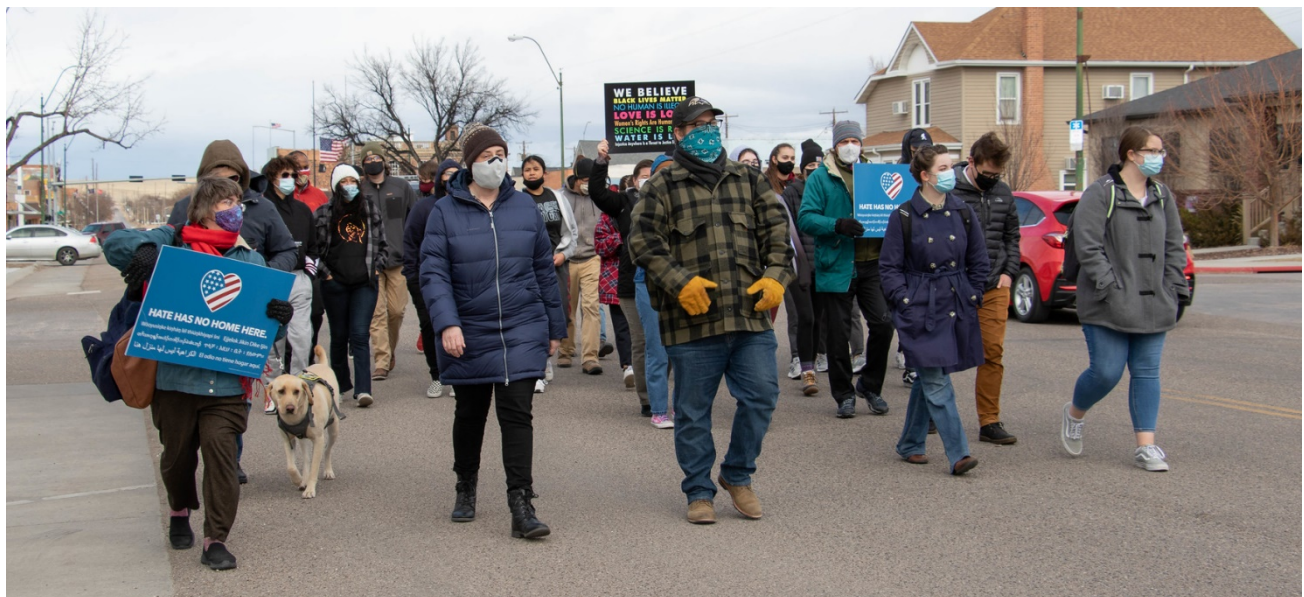
Chadron State students, administration, faculty, and staff participate in a march for Martin Luther King Day as part of a full day of festivities this January.

Thank you for your continued support of the life of Chadron State College.